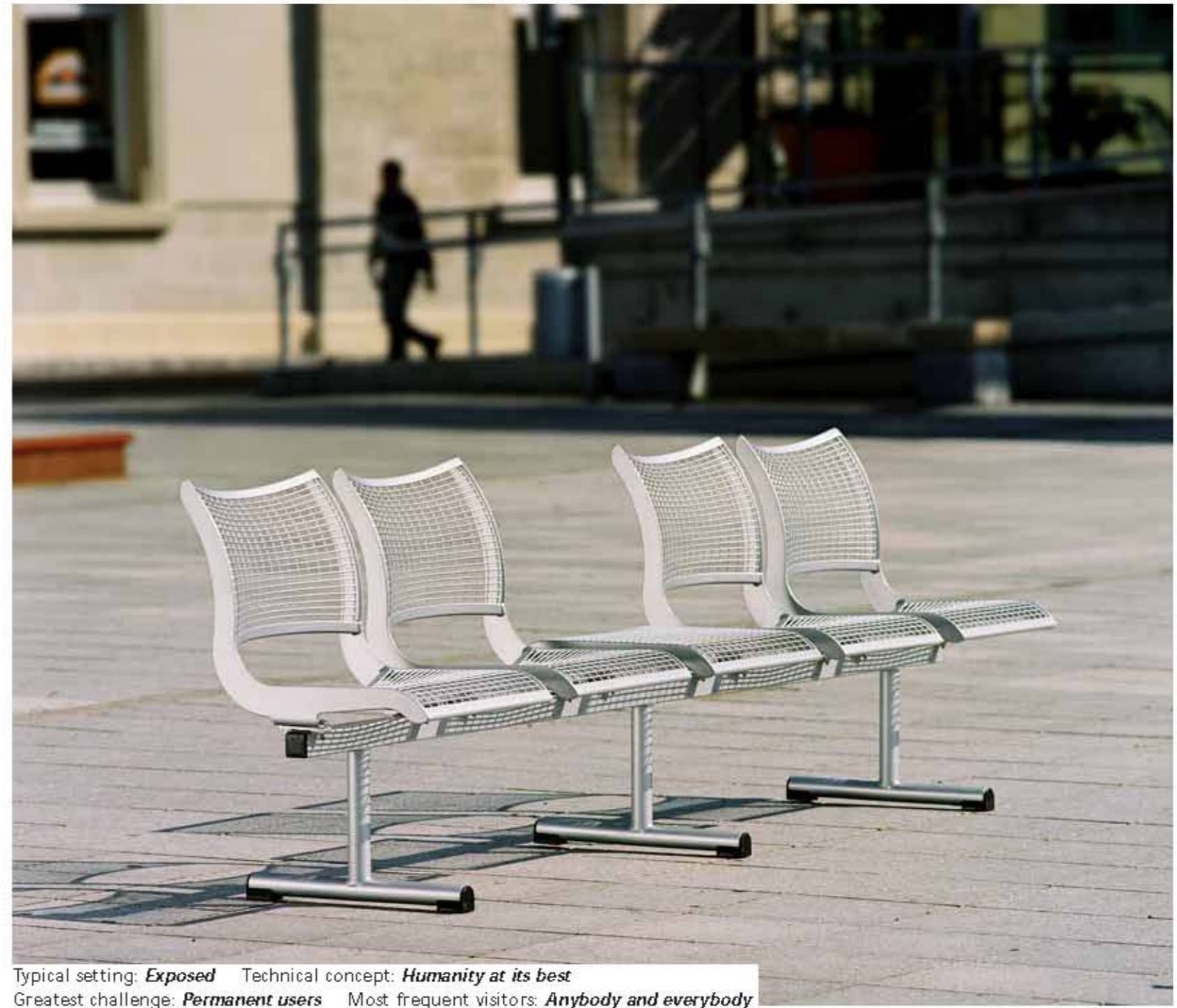
Typical setting: Exposed Technical concept: Humanity at its best Greatest challenge: Permanent users Most frequent visitors: Anybody and everybody