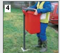
4 Locate and fix bin to post. Full fixing details are provided with each installation kit.