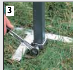
3 Using the one bolt fixing, insert