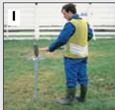
1 Socket is driven into ground using installation cap supplied and sledge hammer.

The Ground-Lock fixing system is quick and easy to install.