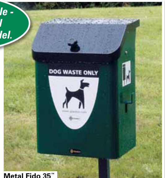
Metal Fido 35™