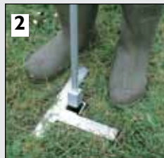
2 Barb is activated using special tool provided.