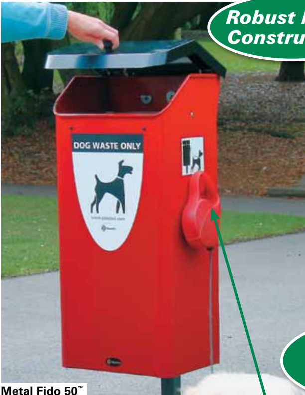
Metal Fido 50™