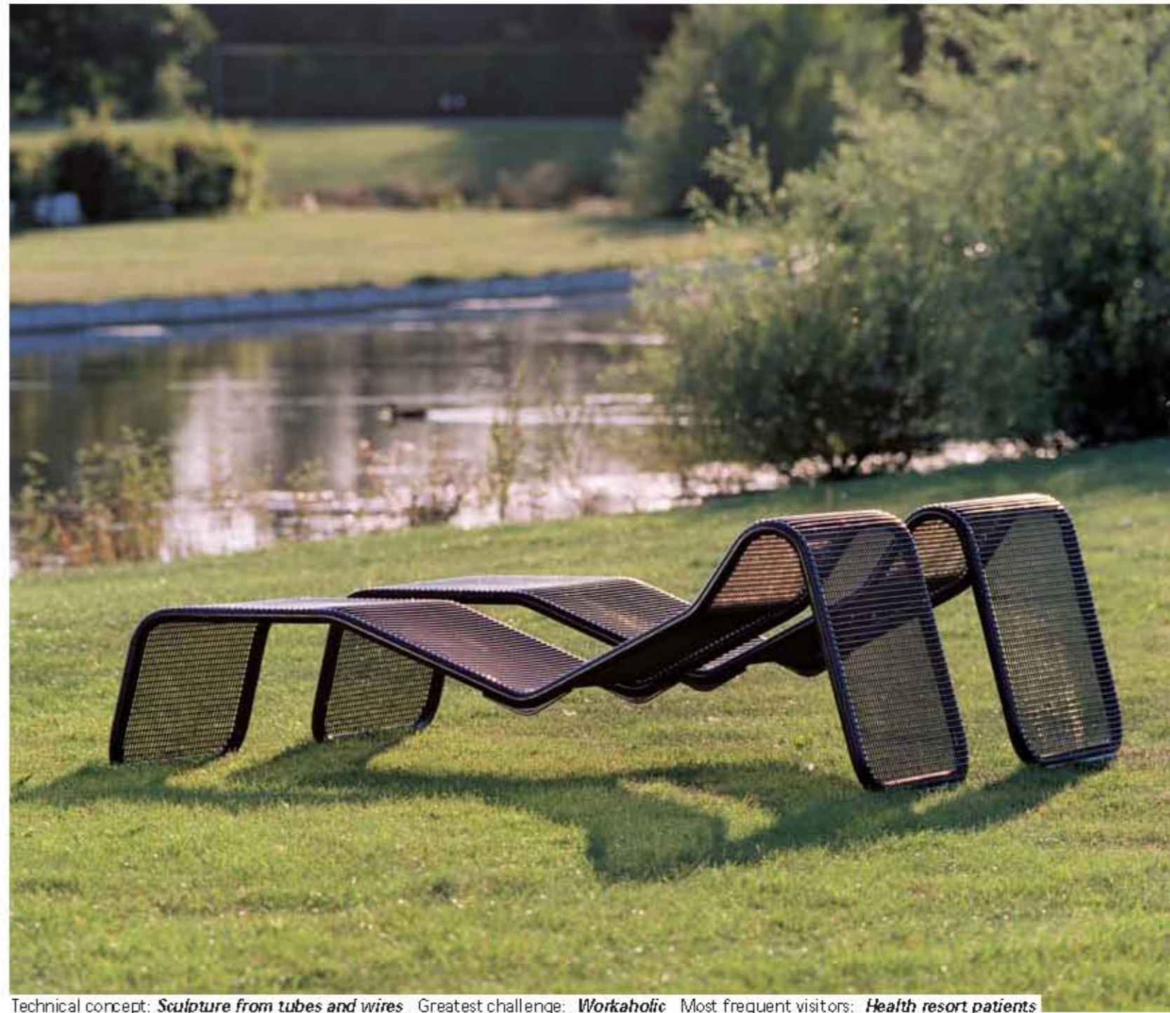
Technical concept: Sculpture from tubes and wires Greatest challenge: Workaholic Most frequent visitors: Health resort patients