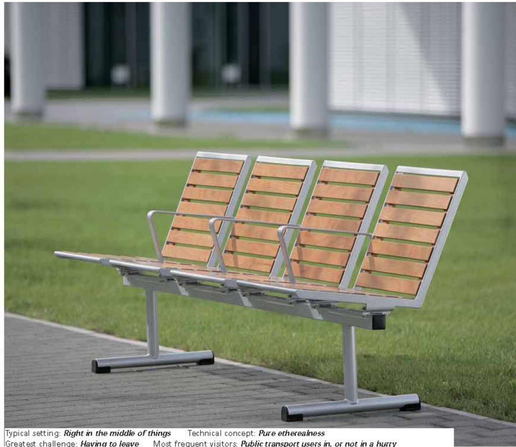
Typical setting: Right in the middle of things Technical concept: Pure ethereality Greatest challenge: Having to leave Most frequent visitors: Public transport users in, or not in a hurry