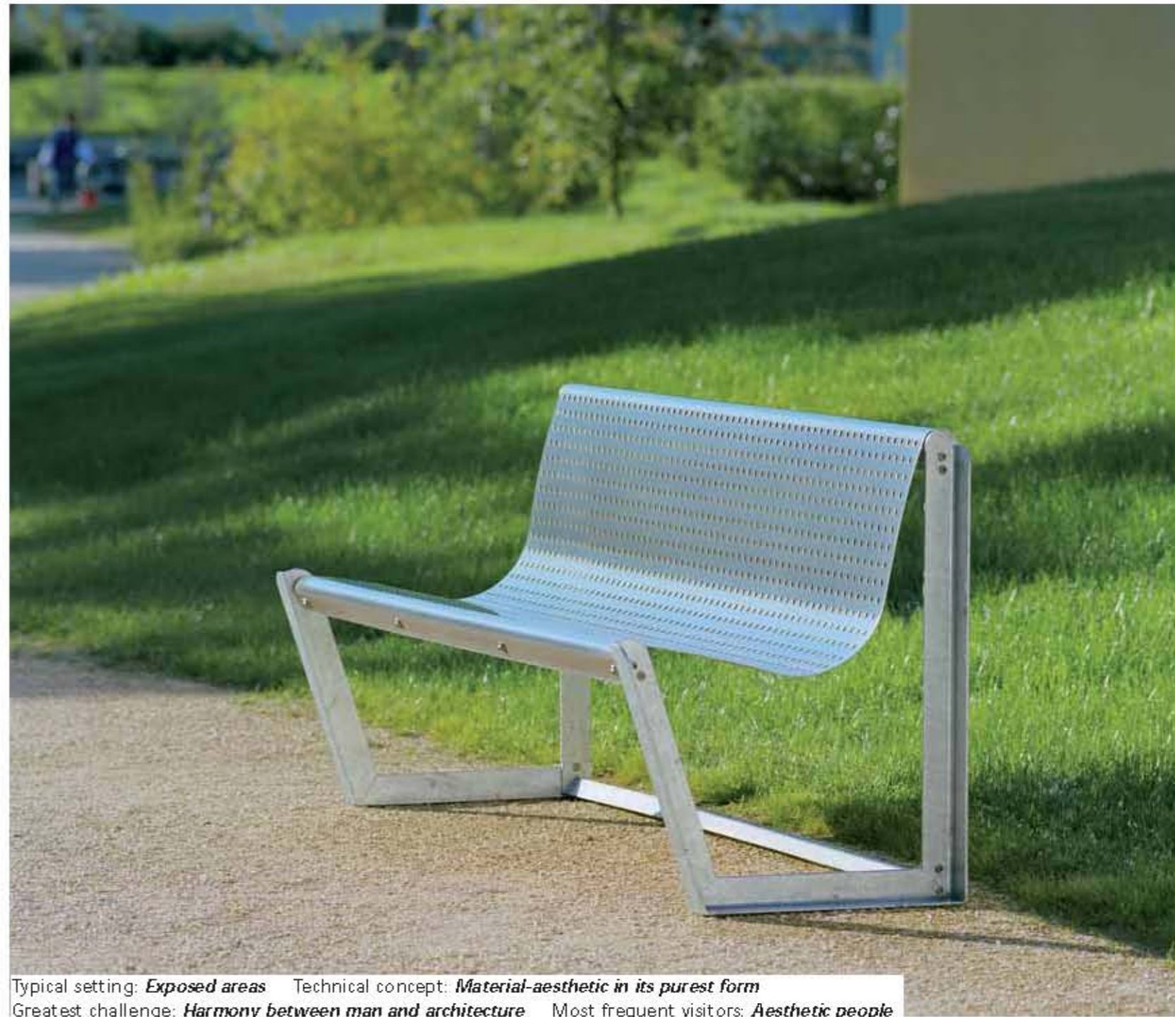
Typical setting: Exposed areas Technical concept: Material-aesthetic in its purest form Greatest challenge: Harmony between man and architecture Most frequent visitors: Aesthetic people